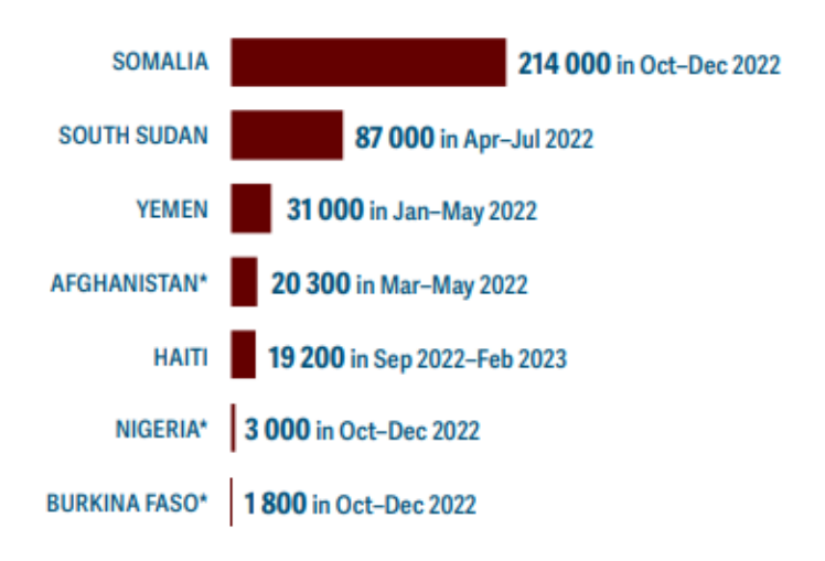
FIGURE 2. Numbers of People facing Catastrophe in (IPC/CH Phase) in 7 countries in 2022

More than half of the 376 400 people in Catastrophe (IPC/CH Phase 5) – starvation and death – were in Somalia, but these extreme conditions also affected populations in South Sudan, Yemen, Afghanistan, Haiti, Nigeria and Burkina Faso (FIGURE 2).